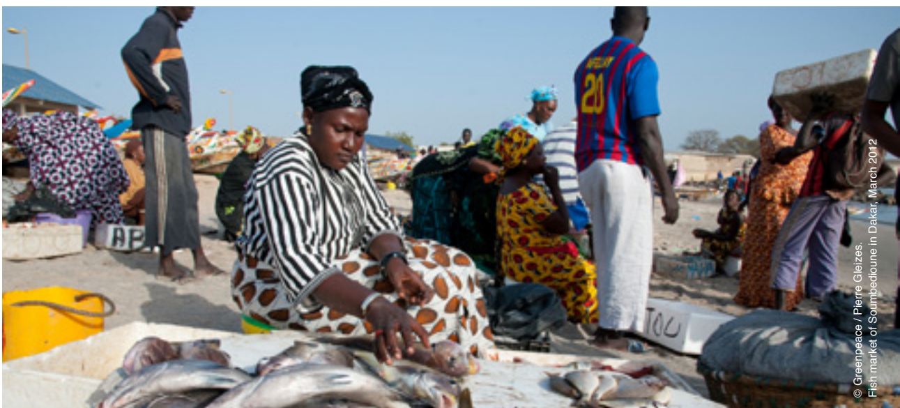
Fish market of Soubédioune in Dakar, March 2012